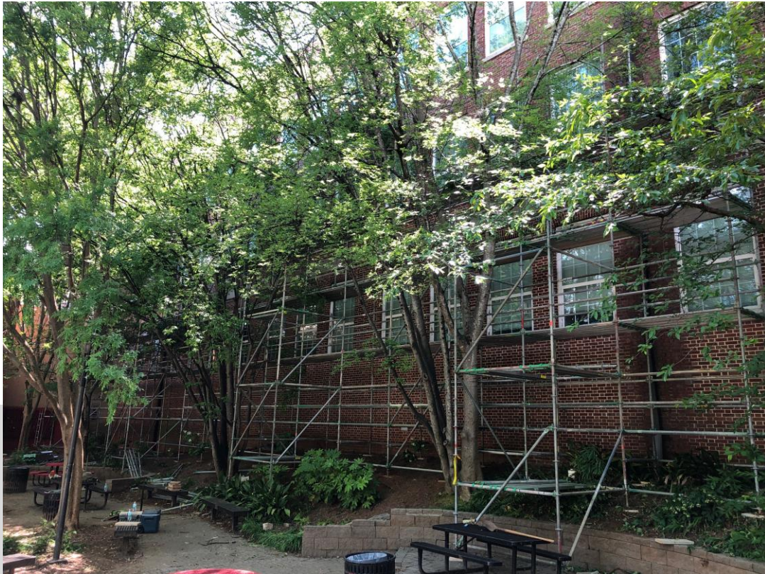
Scaffolding installed on East side of Charles Allen Building