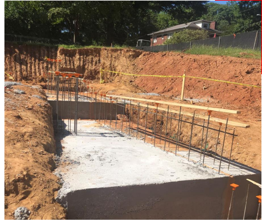
West Foundations complete at New Addition