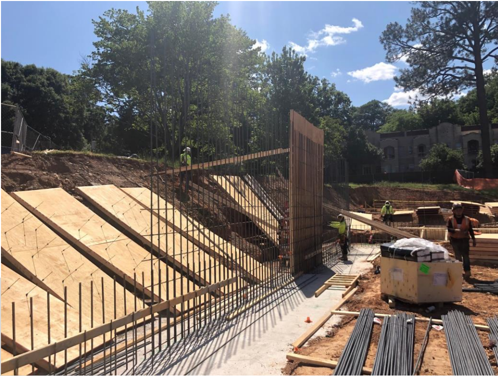
Installation of wall forms on South Wall of New Addition