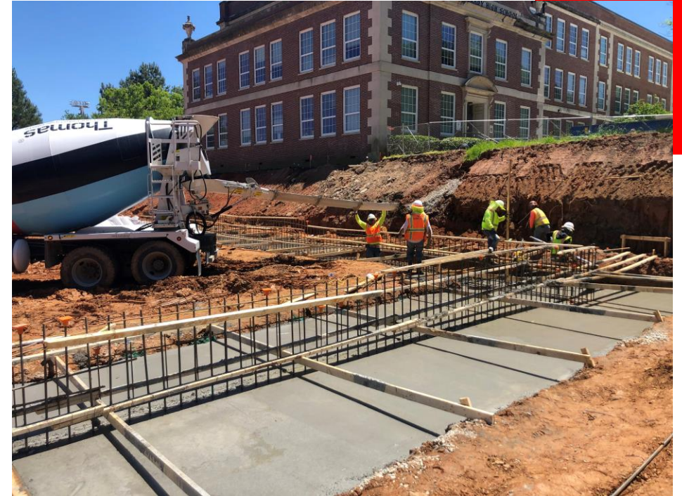
Pouring Concrete at West Foundation